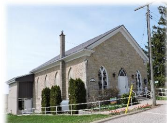
Stone United Church 5370 Fourth Line Rockwood, ON N0B 2K0

Messages are monitored virtually on Thursdays