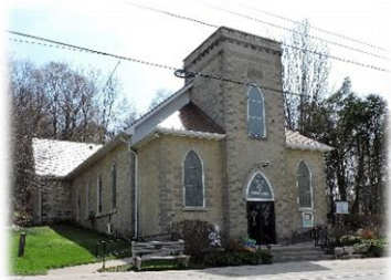
Rockwood United Church 119 Harris St. Rockwood, ON N0B 2K0

Visit our website at www.rockwoodstoneunitedchurches.com